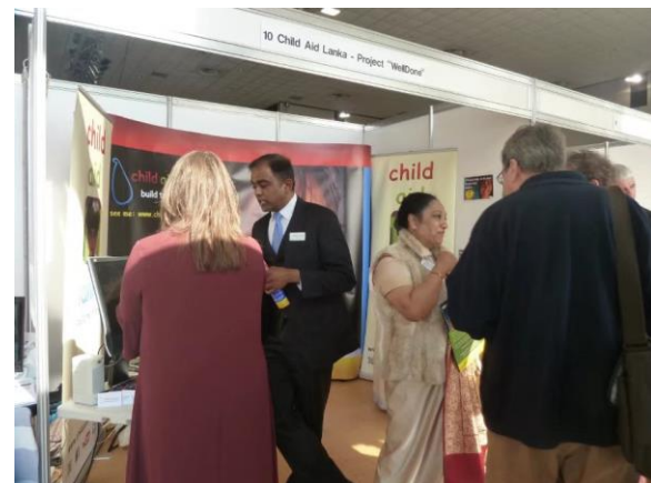
Bournemouth Rotary International Conference 2016

As I write, there is a large co-funded grant application in progress that will raise enough money to construct approximately another 35 wells! This will bring clean water to nearly a thousand children.